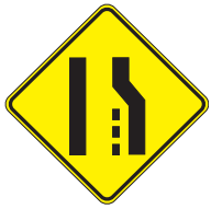
FEWER LANES AHEAD