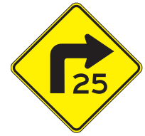
RIGHT TURN 25