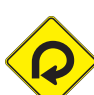
SHARP TURN REDUCE SPEED