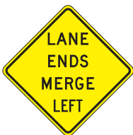
LANE ENDS MERGE LEFT