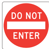
DO NOT ENTER