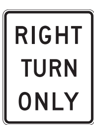
RIGHT TURN ONLY