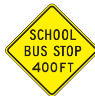
SCHOOL BUS STOP 400FT