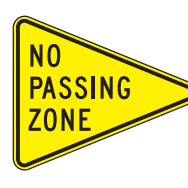
NO PASSING ZONE