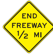
END FREEWAY 1/2 MI