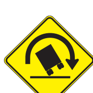
TRUCK ROLLOVER REDUCE SPEED