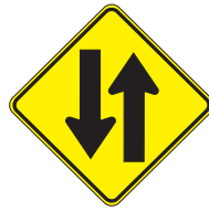
TWO WAY TRAFFIC