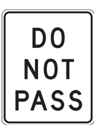
DO NOT PASS