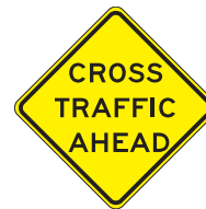
CROSS TRAFFIC AHEAD