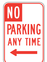
NO PARKING ANY TIME