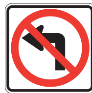
NO LEFT TURN