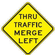
THRU TRAFFIC MERGE LEFT