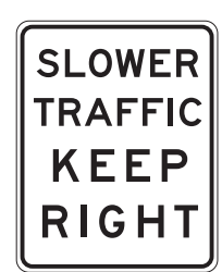
SLOWER TRAFFIC KEEP RIGHT